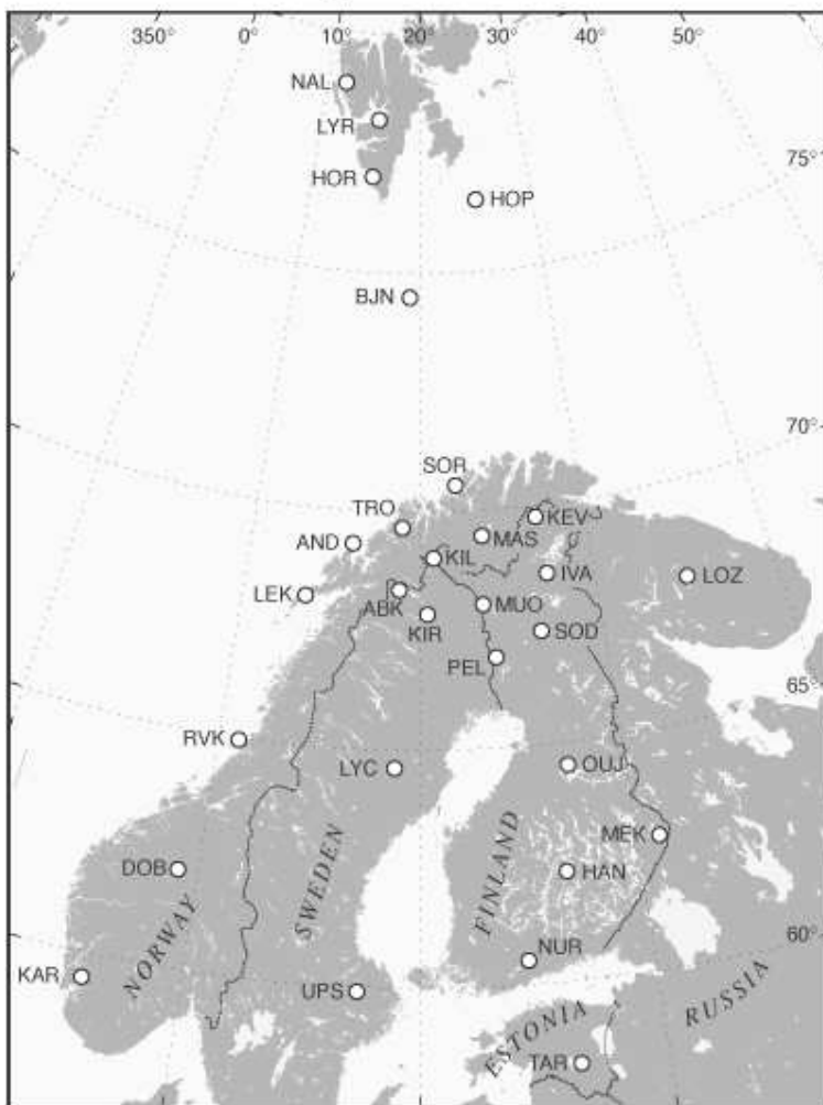
IMAGE Magnetometer Network