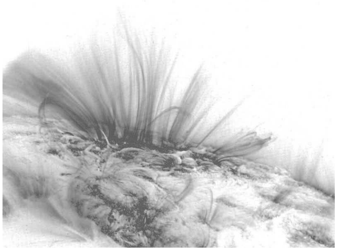
Figure 3: UV image from TRACE. Dark shading is high UV intensity, light is low intensity.